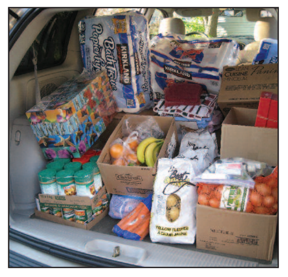
Van loaded with items to be donated.