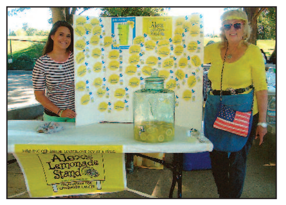
The lemonade stand is ready to go!